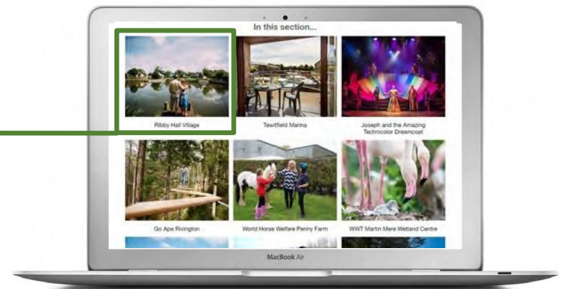
Product displayed on campaign landing page